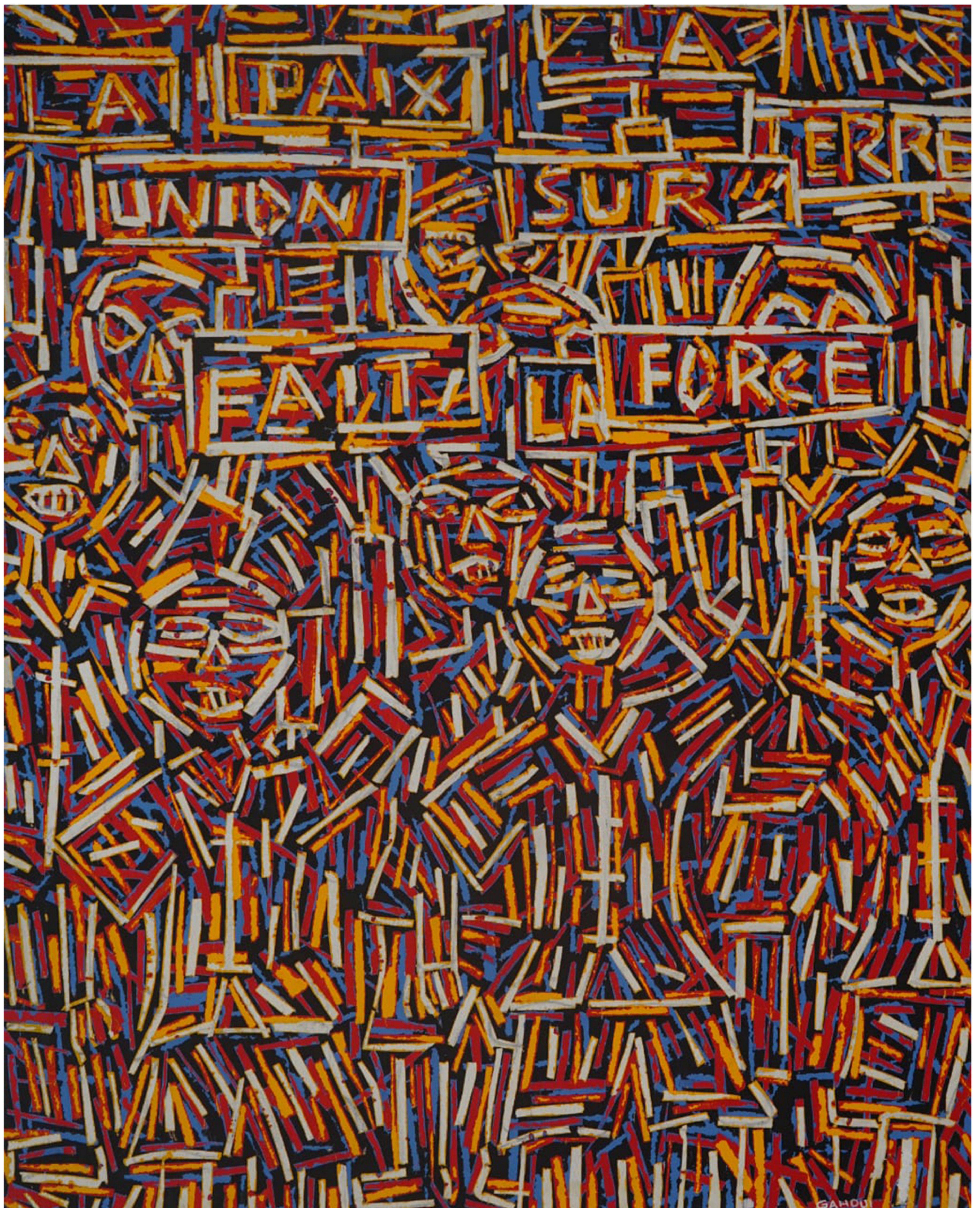
Together 90cm x 100 cm acrylic on canvas 2023